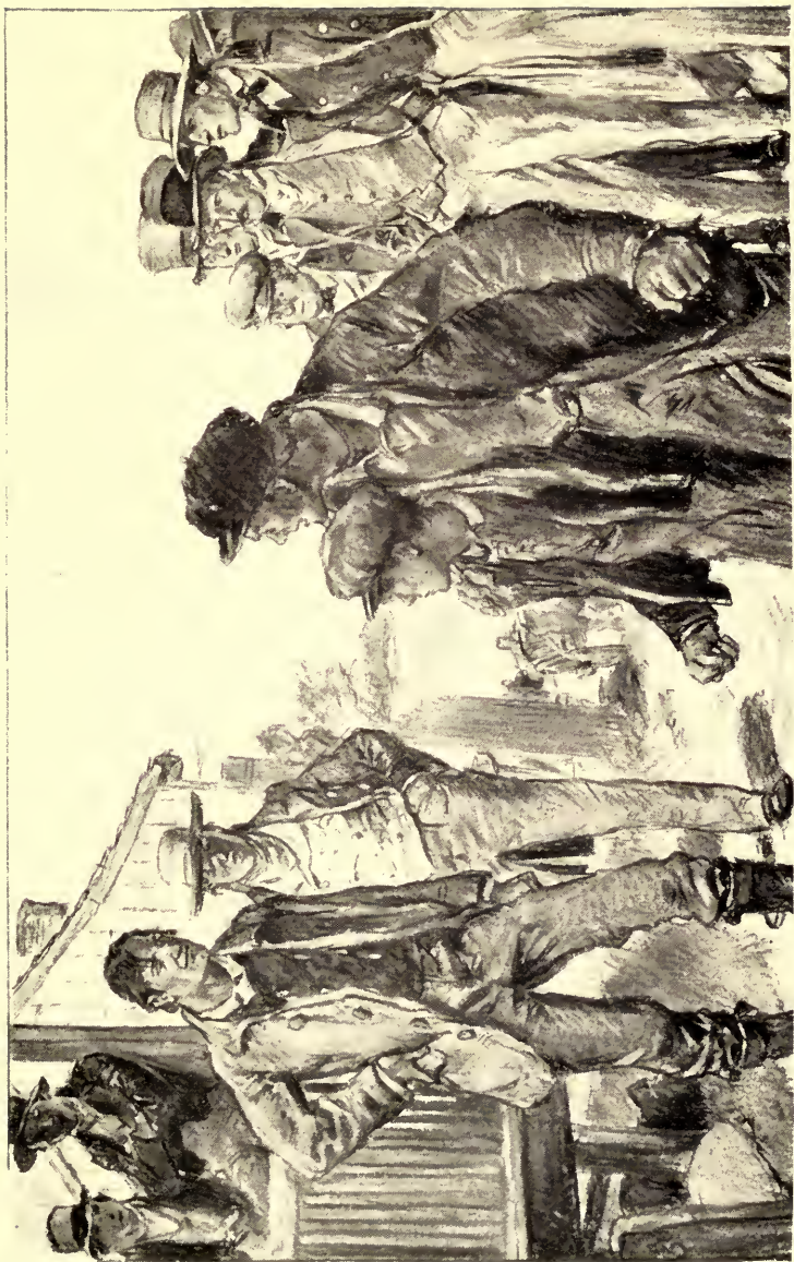
"I'LL BE BACK AGAIN, MISTER, ONE MONTH."